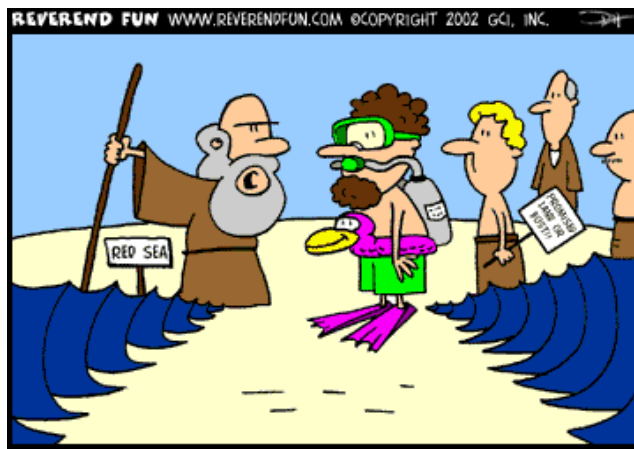
(See Exodus 14) 04-20-1999 I THINK THAT YOU HAVE SOME SERIOUS FAITH ISSUES